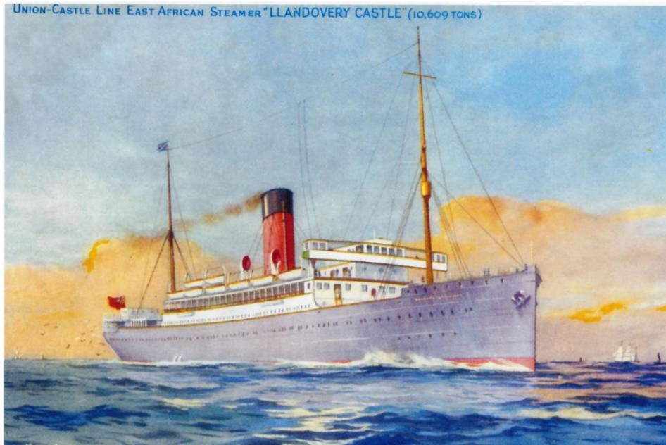
Figure 1. Postcard view of SS Llandoverly Castle, 1914

Online appendices are unedited and posted as supplied by the authors.