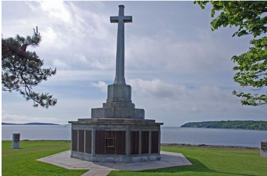
Figure 7. The Halifax Memorial