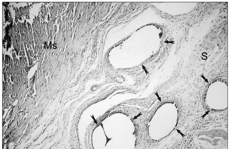
FIG. 1. Photomicrograph on the 10th day of a closure site to which histoacryl glue had been applied. Most of the glue has dissolved during tissue processing, leaving empty spaces (marked with tailed arrows) surrounded by foreign body giant cell-type granulomatous inflammation in the serosa (S). The muscularis layer of the duodenum (Ms) was intact (hematoxylin-eosin stain, original magnification \times 100 ).