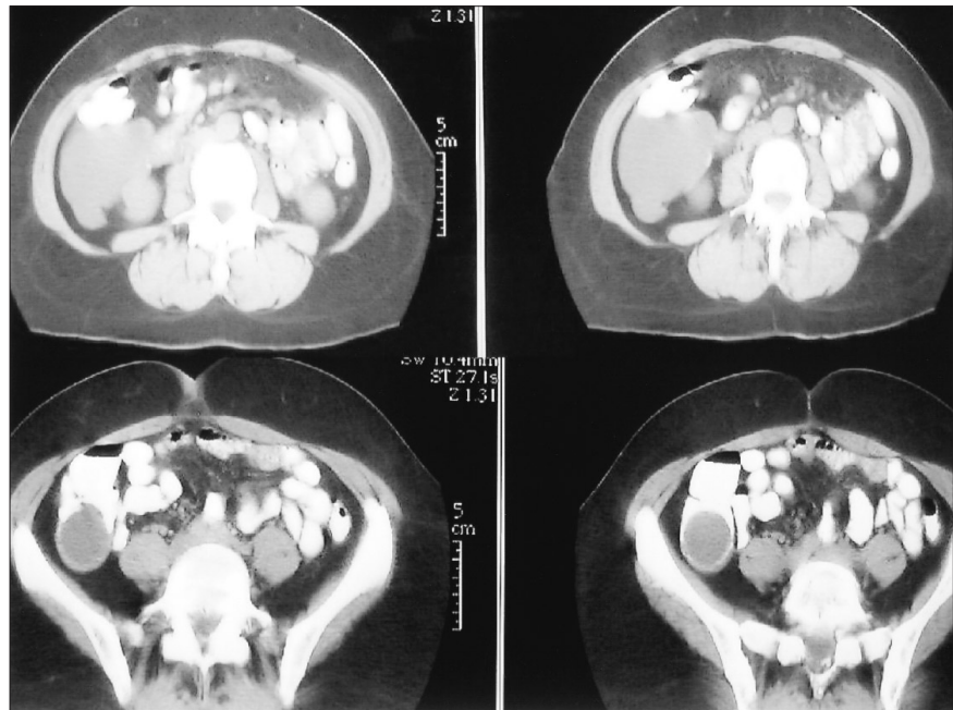
FIG. 1. Computed tomography scans of the abdomen demonstrate a large complex mass in the right retrocecal region.

been defined as an abnormal accumulation of mucus, distending the appendiceal lumen, regardless of the underlying cause. 2 Recurrent inflammation, fecalith, carcinoid, carcinoma, villous adenoma and endometriosis are causes of obstruction of the appendiceal lumen that may potentiate mucoceles. There are several different classifications of muco-