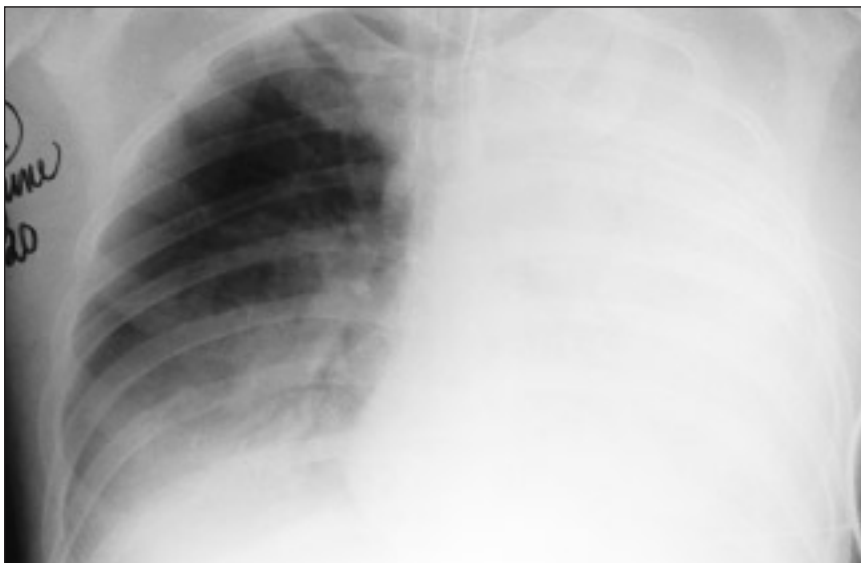
FIG. 3. Portable chest radiograph obtained immediately after operation shows re-expansion pulmonary edema.