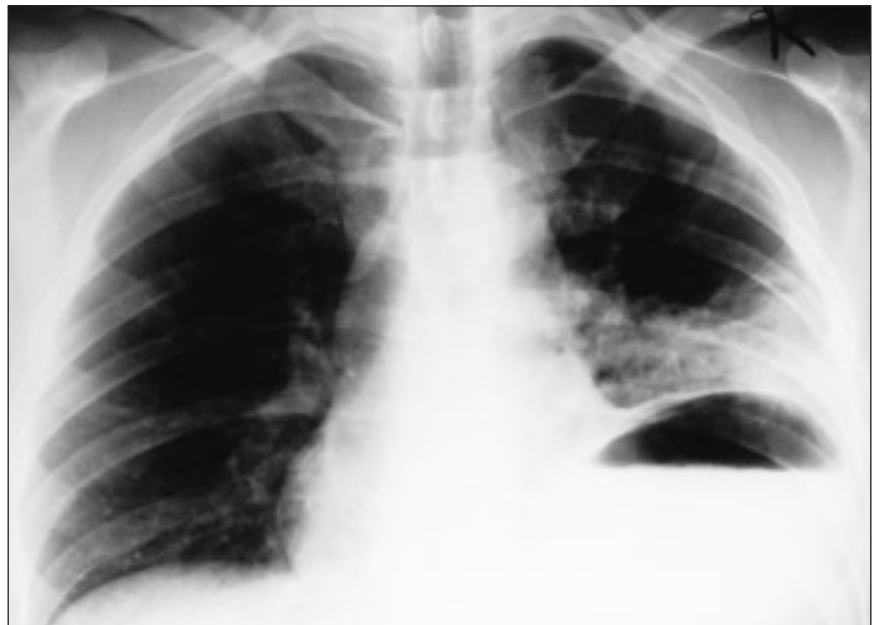
FIG. 1. Posteroanterior radiograph obtained directly after the accident. There is no notable elevation of the left hemidiaphragm with atelectasis and fractured ribs.

During the initial resuscitation he was found to have an oxygen saturation of 60% on room air, respiratory rate 27 respirations/min, a heart rate of 130 beats/min, a blood pressure of 170/112 mm Hg and a body temperature of