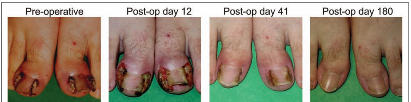
Fig. 3. Images showing healing by secondary intention following surgical nail-fold excision. Post-op = postoperative.