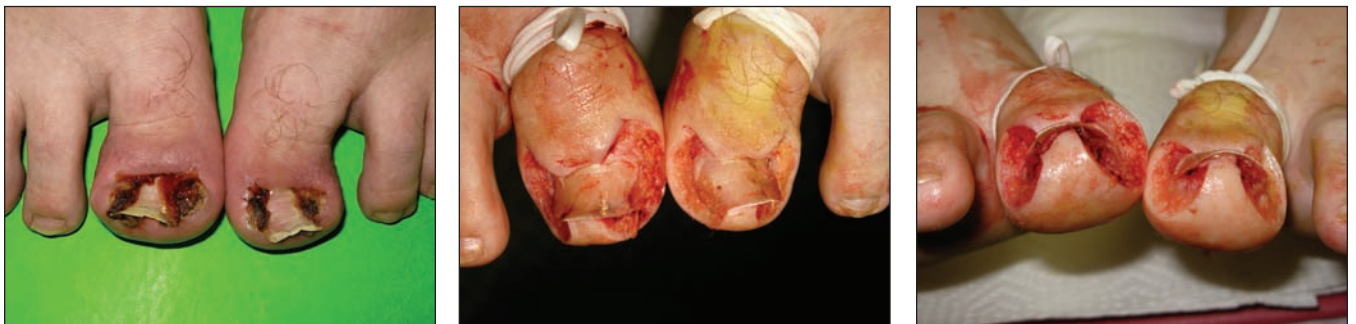
Fig. 1. Examples of the severity of ingrown toenails surgically corrected by soft-tissue nail-fold excision. The preoperative appearance (left) highlights the extensive medial and lateral nail-fold granulation tissue. The images obtained in the postoperative period (centre, right) show the surgical site following nail-fold excision. The excision of soft tissue was typically generous and adequate, with all portions of the granulation tissue removed.

Mesh tulle gauze ( 10 \times 10 cm) was folded and applied over the site of the excision followed by 2 gauze pads ( 5 \times 5 cm) and a snug dressing of rolled gauze (5-cm width). The patients were instructed to soak their feet after 48 hours in a warm water bath for 15–20 minutes, during which time the dressings were removed and replaced with new clean dressings. Patients were instructed to subsequently soak their toes 3 times per day for 15–20 minutes in a warm water bath for 4–6 weeks. Pain control was achieved with