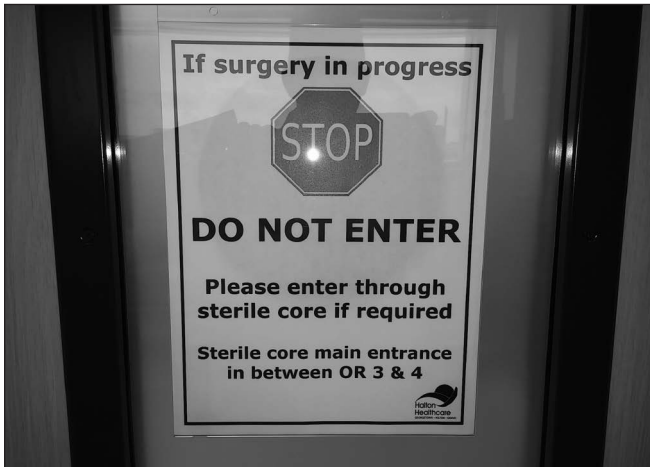
Fig. 3: Signage minimizing operating room traffic.