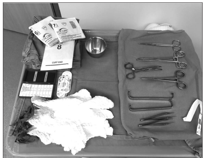
Fig. 2: Closing tray.