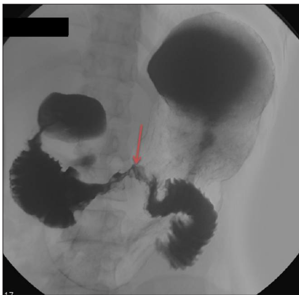
Fig. 1. Esophagogastroduodenoscopy shows narrowing (arrow) at the junction of the third and fourth parts of the duodenum.

A 28-year-old woman presented with an 8-month history of gastritis and increasingly frequent vomiting immediately after food intake. She also described having lost a substantial amount of weight over 2 months. On examination, her upper abdomen was distended and there was visible peristalsis. There was no jaundice or significant lymphadenopathy. An esophagogastro-duodenoscopy showed narrowing of the lumen at the junction of third and fourth parts of the duodenum (Fig. 1), with an apparently normal mucosa. A blind biopsy of tissue from the junction was sent for histopathological examination. Considering her age and medical history, we made a provisional clinical diagnosis of benign stricture and requested a barium meal examination to determine the extent of the lesion and to plan surgery. Meanwhile, histopathology results reported a moderately differentiated adenocarcinoma