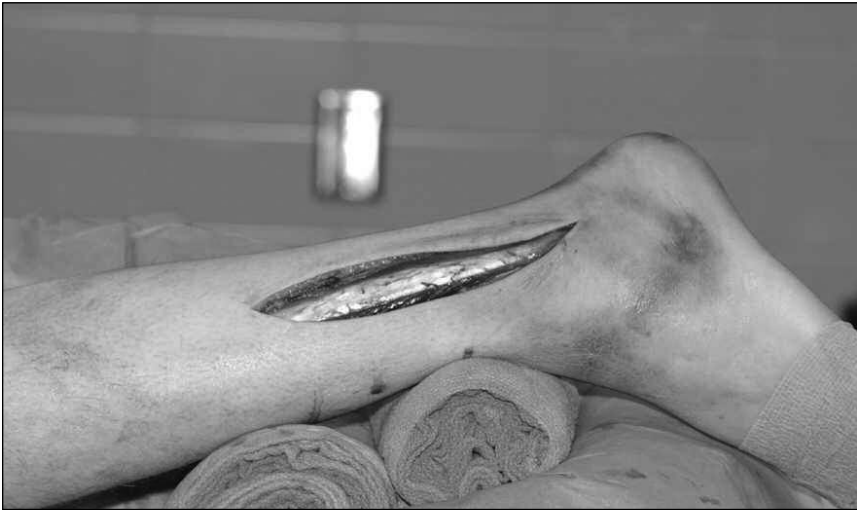
FIG. 1. The skin is incised, showing the peroneal tendons.