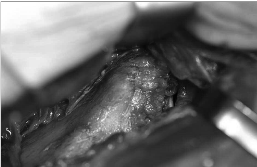
FIG. 2. View of the posterior fragment in the interval between the peroneal tendons and the flexor hallucis longus.