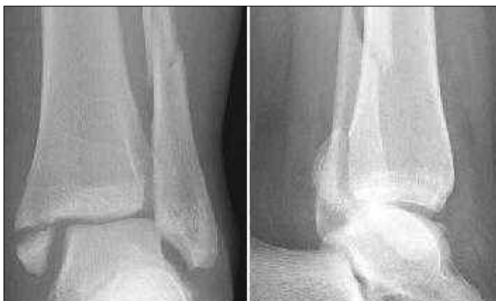
FIG. 4. Anteroposterior and lateral radiographs showing a displaced trimalleolar fracture.