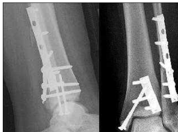
FIG. 5. Postoperative anteroposterior and lateral radiographs. An antiglide plate has been applied to the fibula. Lag screws and a buttress plate have been used to fix the posterior malleolus.

the implants, which the authors advocate. Alternatively, C-arm imaging can be omitted, and radiographs can be taken after fixation. Figure 4 and Figure 5 show typical preoperative and postoperative radiographs, respectively.