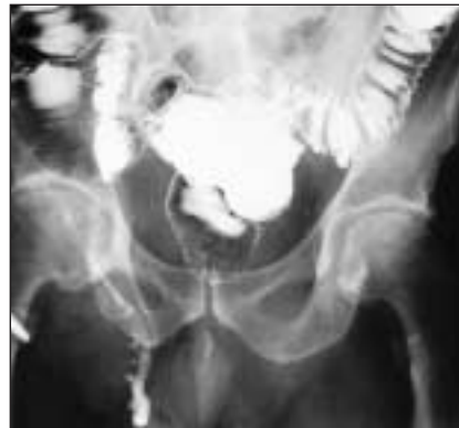
FIG. 1. Barium enema examination showing the vermiform appendix in a right inguinal hernia.