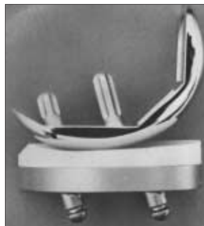
FIG. 3. Cemented unicondylar knee prosthesis (Johnson & Johnson PFC).