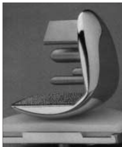
FIG. 2. Cementless unicondylar knee prosthesis (Whiteside Ortholoc II—Wright Medical Inc.).

plasty roentgenographic evaluation and scoring system. 29 This consisted of measuring the standard total knee angles ( \alpha , \beta , \gamma and \sigma ) (Fig. 2) to ensure proper placement of the prosthesis in the knee joint, and then calculating the amount of periprosthetic radiolucency in millimetres (Fig. 2).