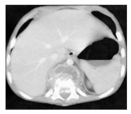
FIG. 2. A CT scan demonstrates a significant mass lesion with notable vertebral destruction.

Three months postoperatively, the boy showed acceptable spinal alignment, and his brace was converted to a thoracolumbosacral orthosis. Findings on neurologic examination were normal. The combination antituberculous therapy was continued. Follow-up clinical examination at 6 months demonstrated normal spinal alignment and radiographic evidence of fusion. The boy was healthy and