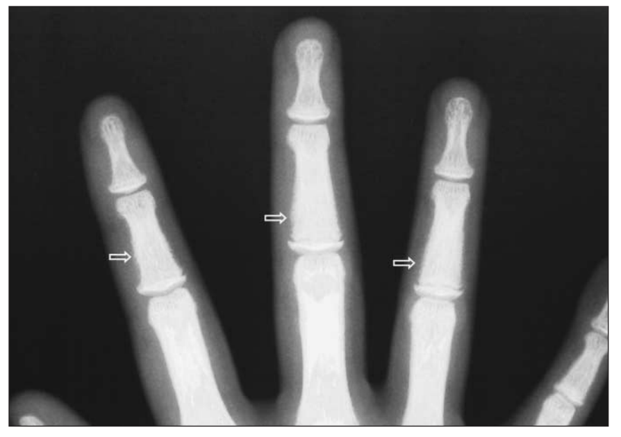
FIG. 5. Plain radiograph of the fingers demonstrates extensive subperiosteal bone resorption of the phalanges (arrows).

Histologically, these lesions are characterized by the presence of hemosiderin pigment deposits and osteoclastic giant cells arranged in groups and separated by richly vascularized fibrous tissue. Zones of recent