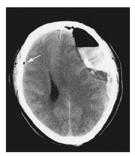
FIG. 2. Computed tomography scan 1 hour after creation of a burr hole on the wrong side and a burr hole made on the correct side to drain a left subdural hematoma. Blood and air are visible in the left subdural space. The arrow points to a residual drop of subdural air at the site of the wrong-sided (right) burr hole.

The patient recovered fully and 2 months after admission was neurologically intact and had a normal CT (Fig. 3). He was well 1 year later. At the time of this writing, neither the patient nor his family have initiated medicolegal action or made any formal complaint.